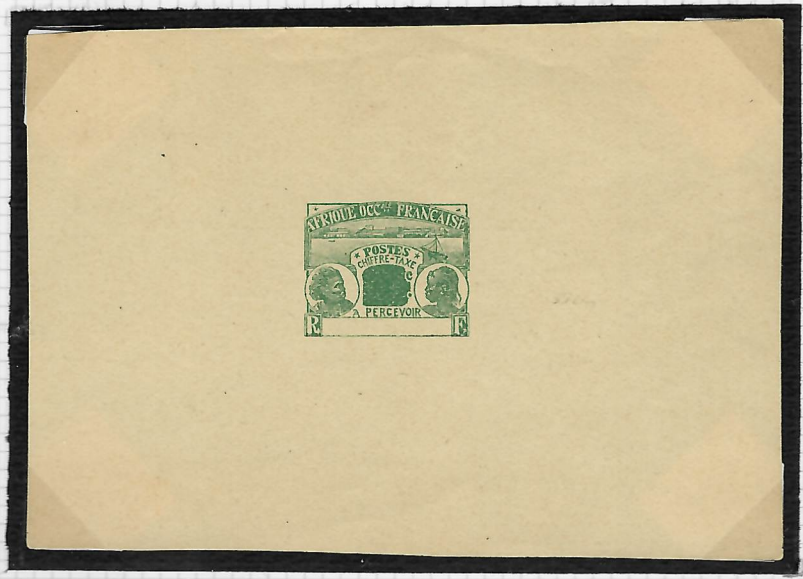
Timbre - Taxe